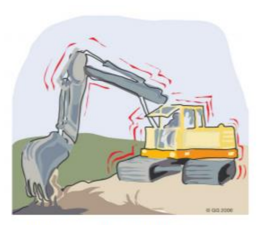
Whole-Body vibration (WBV)