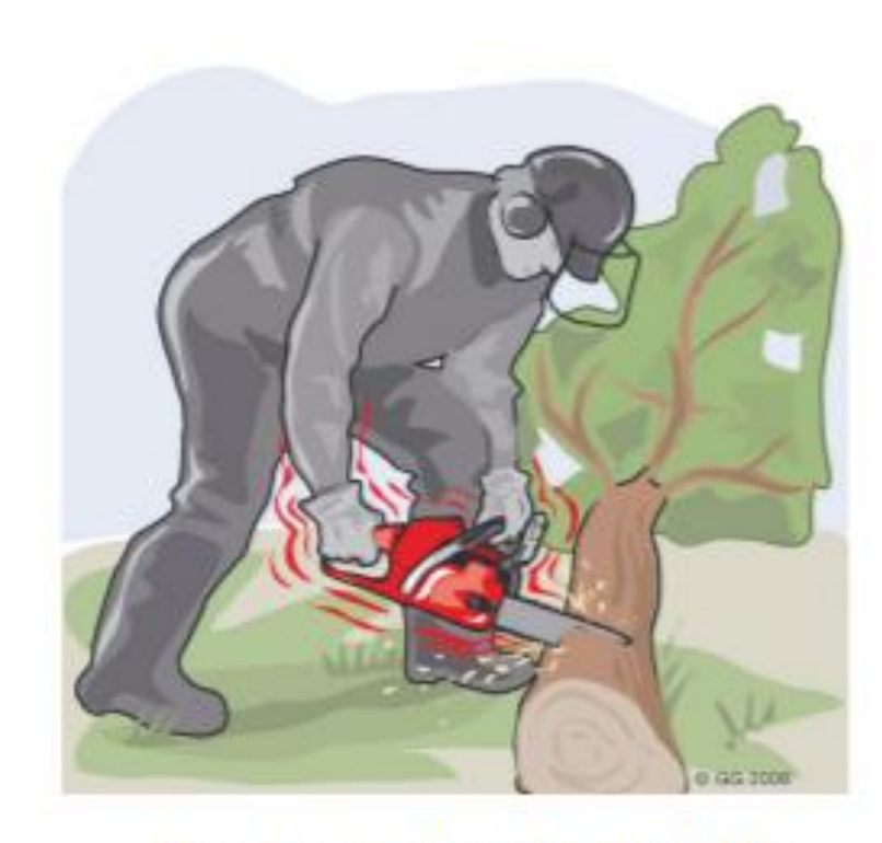
Hand-arm vibration (HAV)